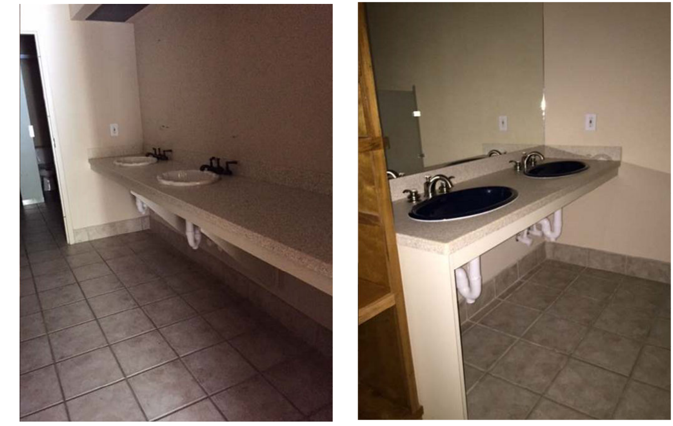
ADA FIXTURE PHOTOS